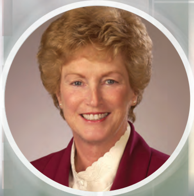
Governor M. Jodi Rell